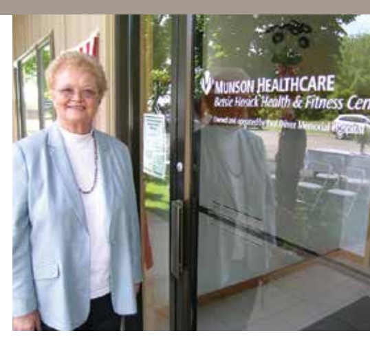
In 2019, the Betsie Hosick Health and Fitness Center provided over 2,200 fitness and wellness classes and had over 43,000 visits.

"This hospital would not be what it is today without the support of this amazing group of volunteers,"